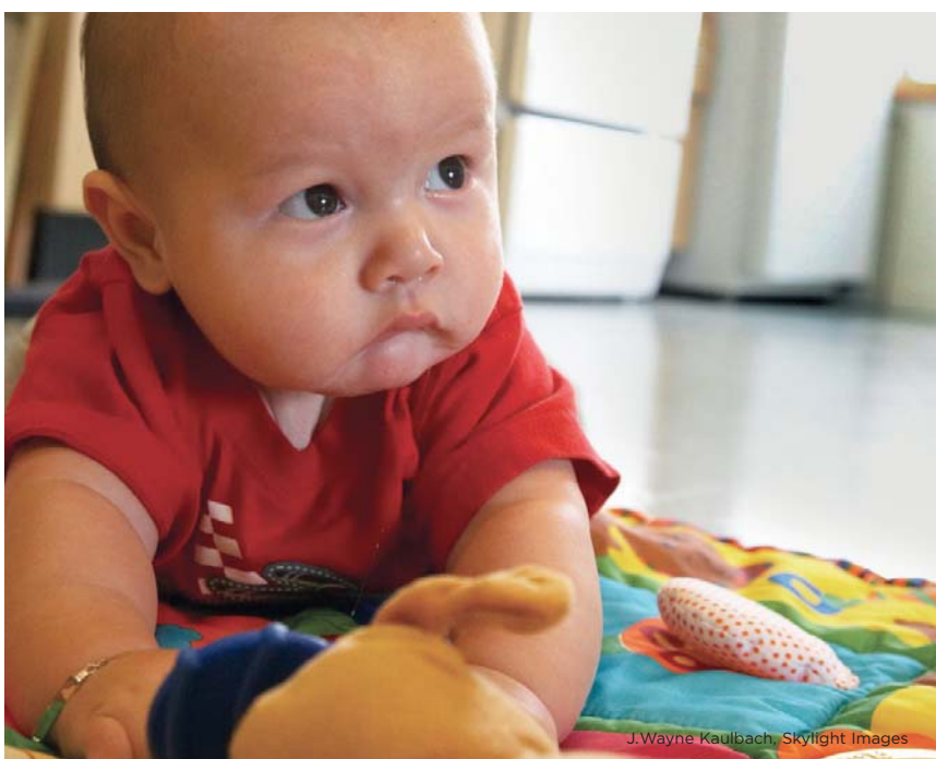
J.Wayne Kaulbach, Skylight Images