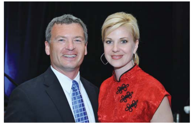
LEFT: The pre-event reception.